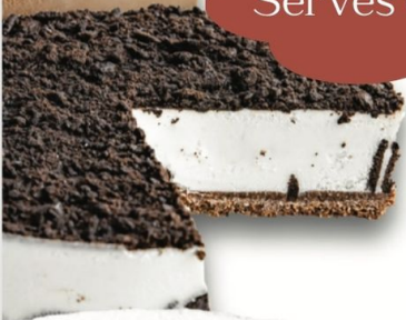
Cookies & Cream