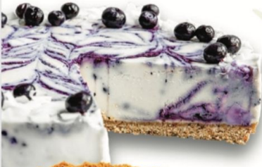
Blueberry & Coconut