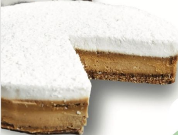
Coconut & Salted Caramel